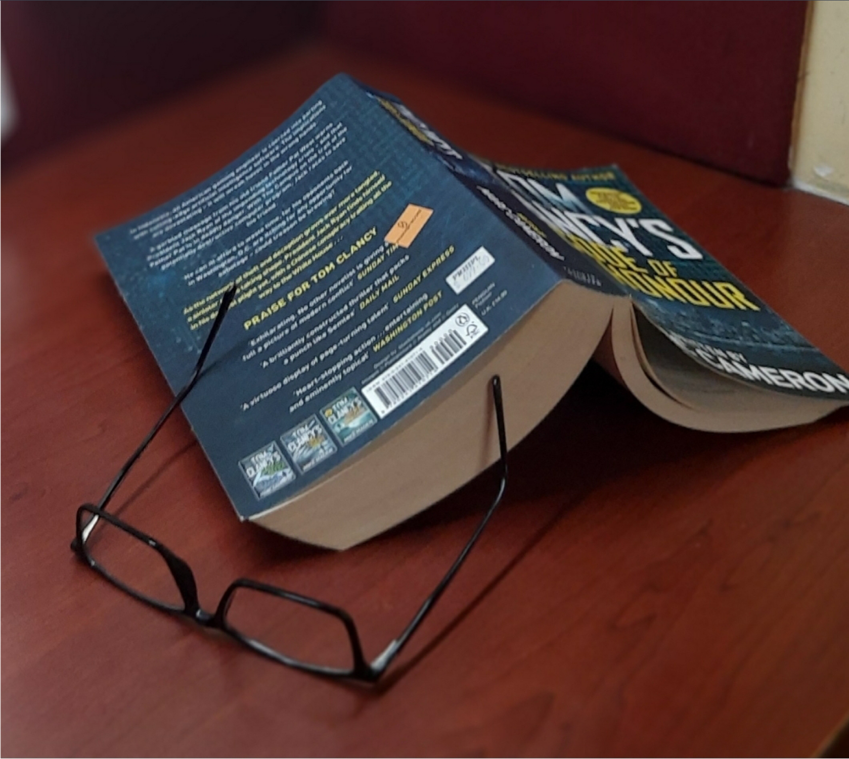
SOMAK LAHIRI 8E