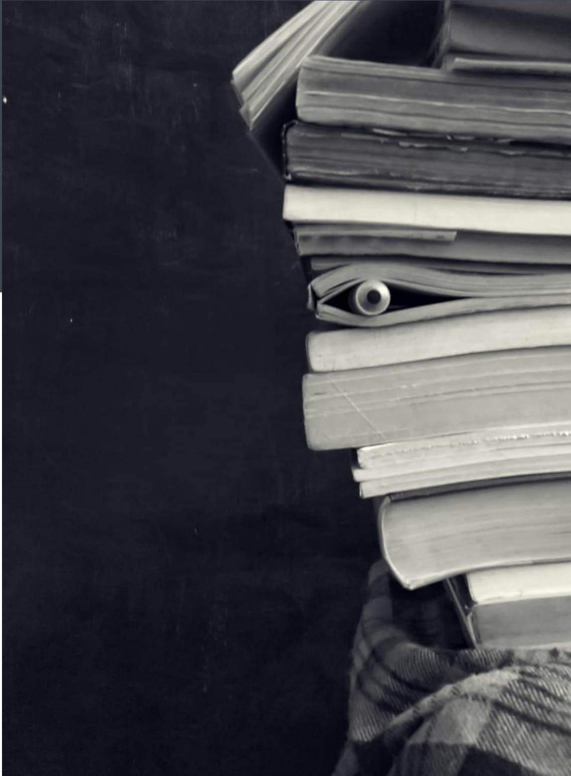
SOURAJIT KARMAKAR 9A