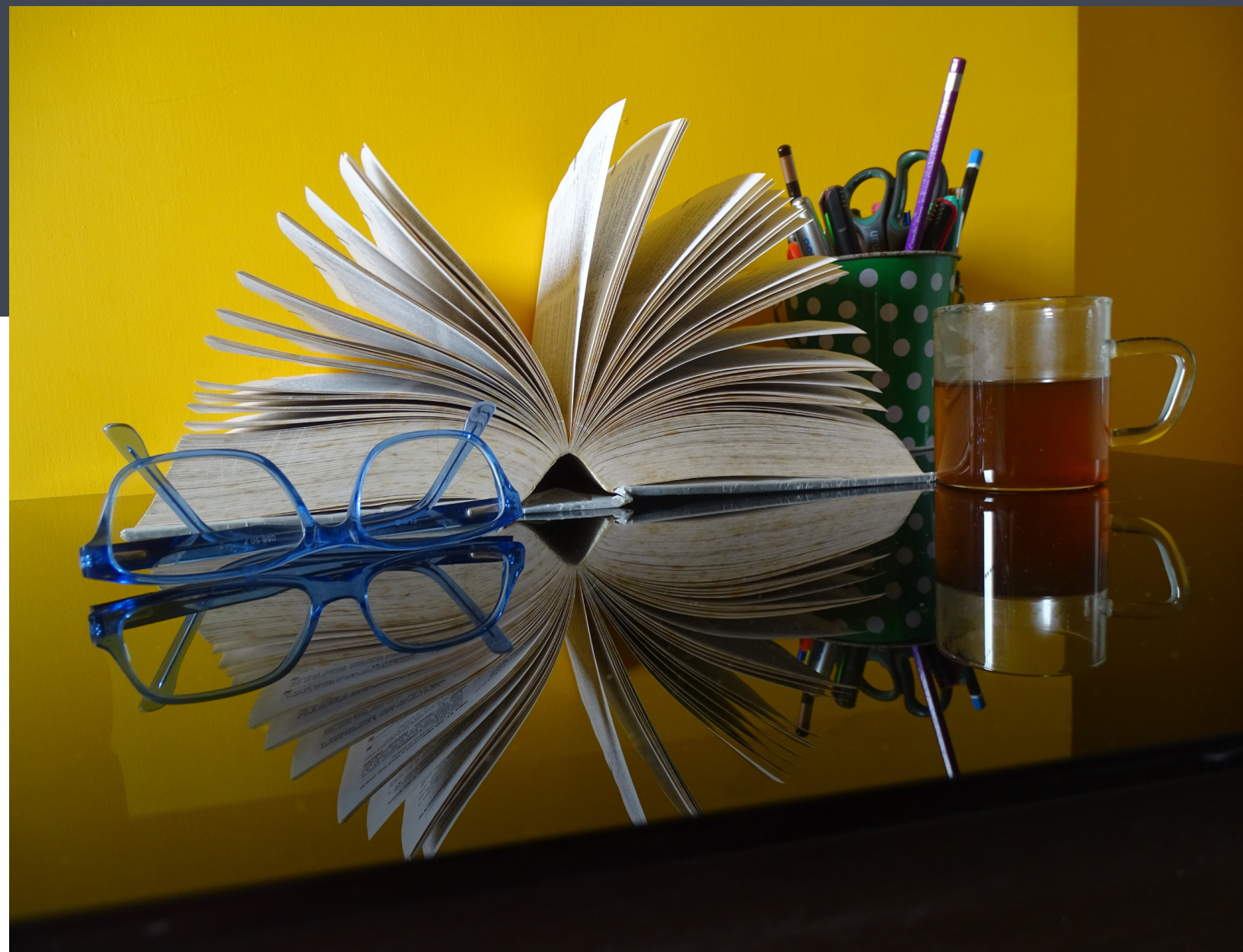
RISHIKESH NEOGI 8D