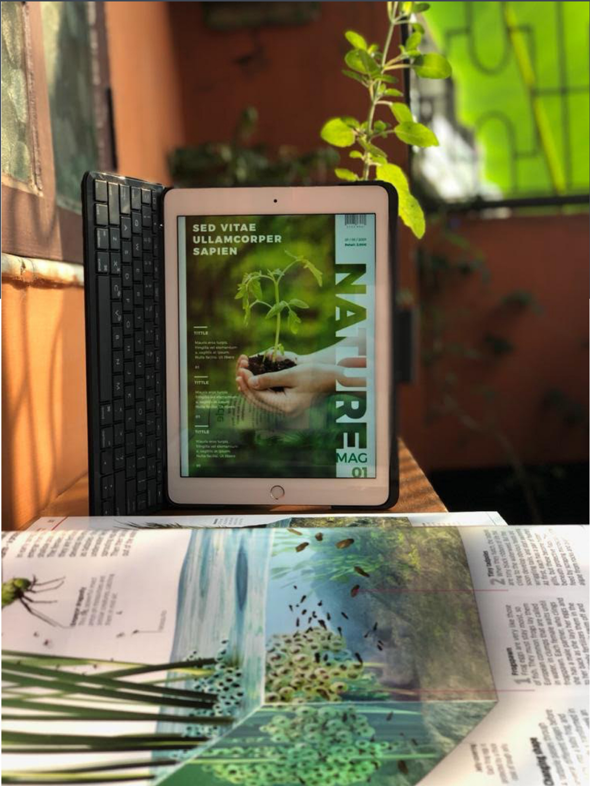
STOTRA GHOSH MONDAL 8F