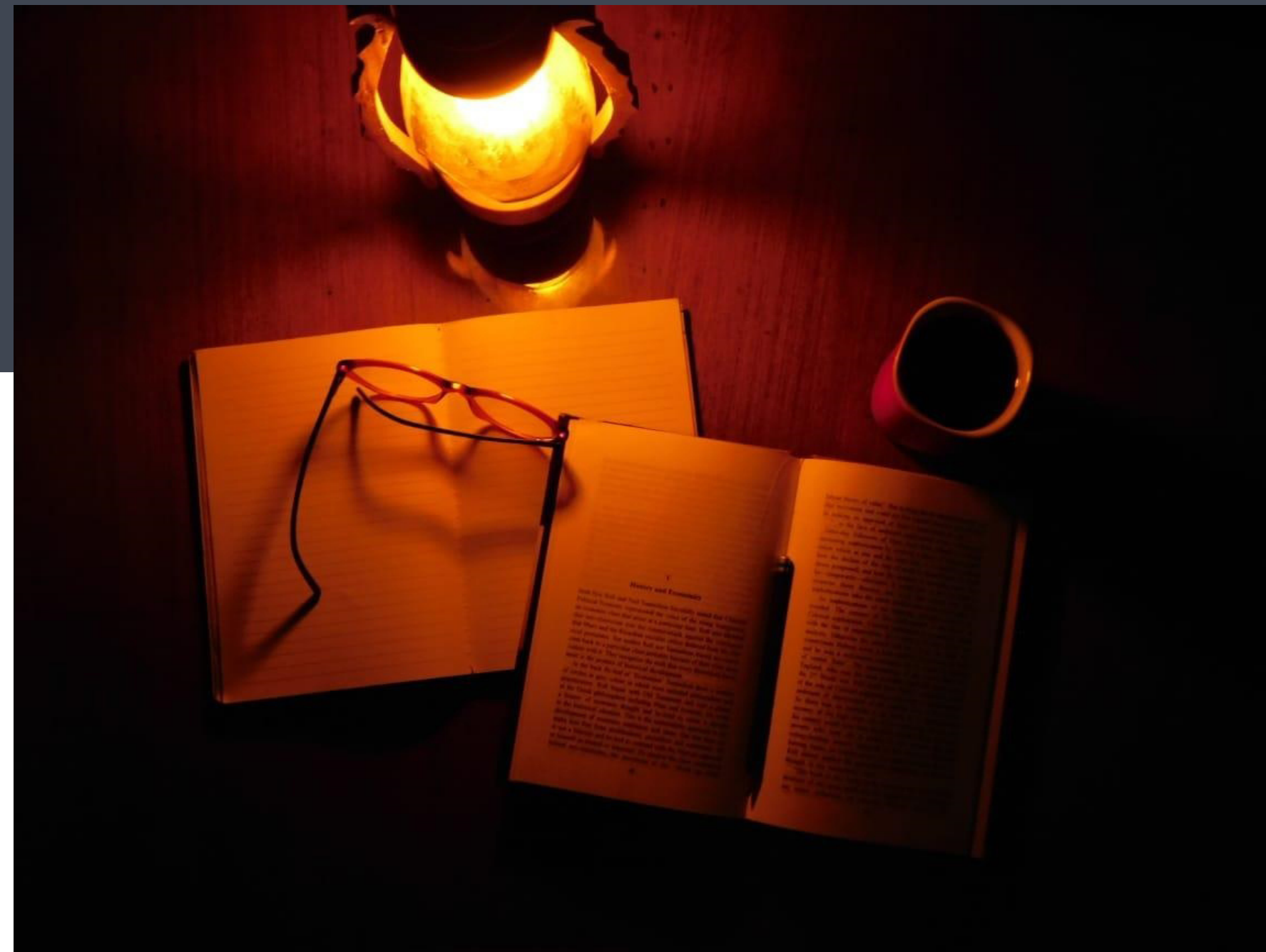
SHRESHTHA MITRAA 8D