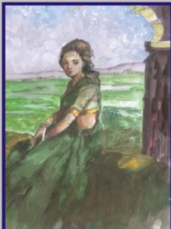
Artiste of the Issue